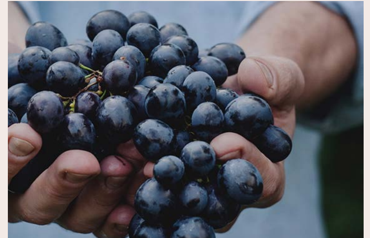
private wine tasting experience