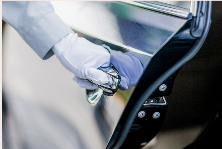
luxury guided tours