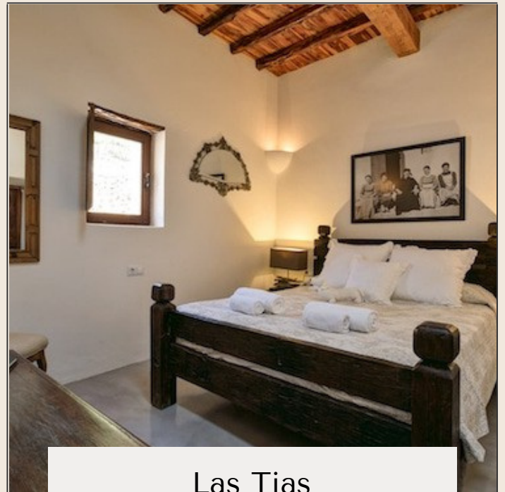
Las Tias Shared Bathroom

6 double bedrooms provide accommodation for 12 people