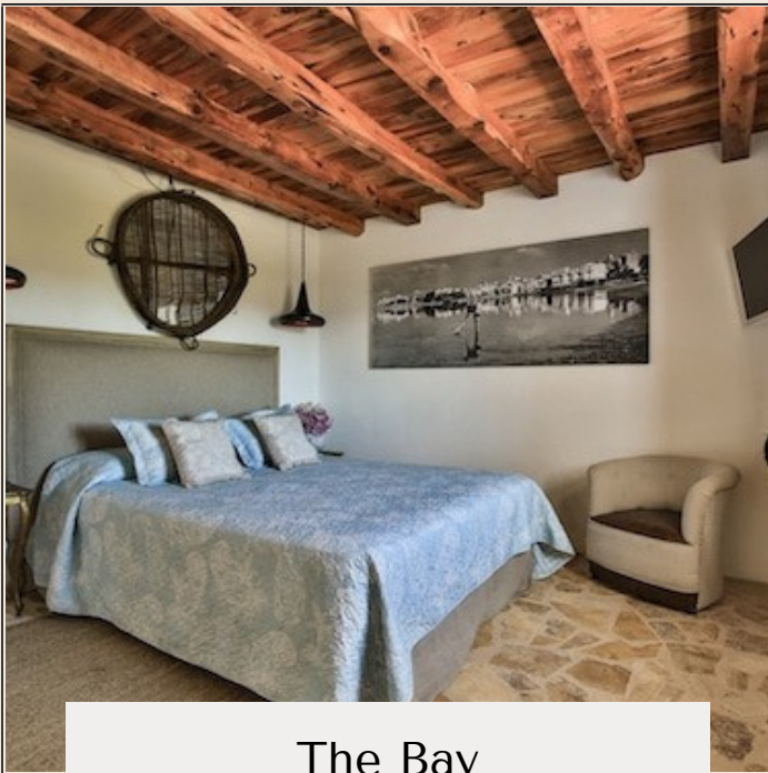
The Bay Bathroom + Ensuite