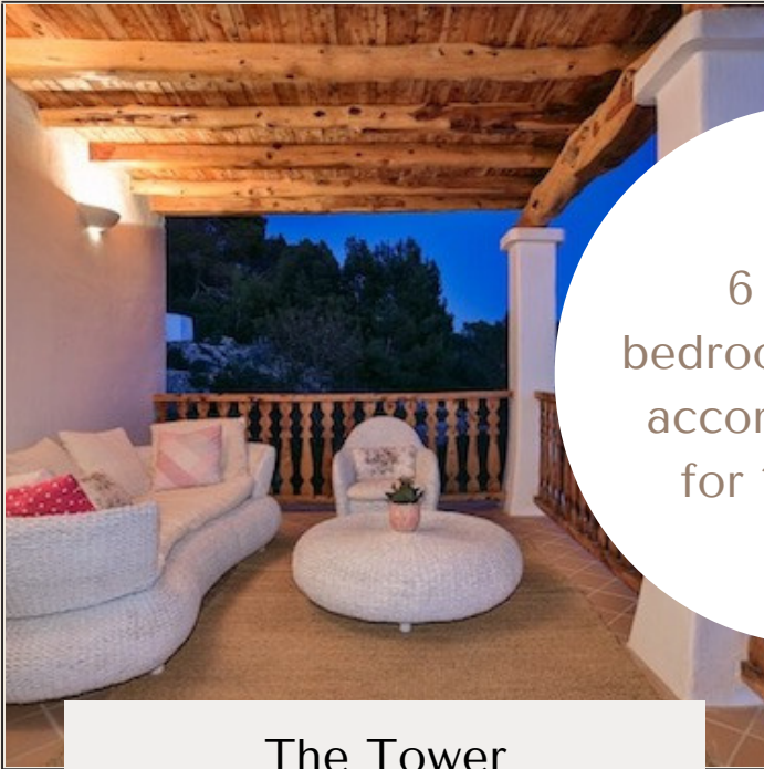
The Tower Primary Suite