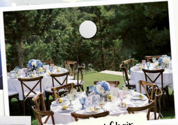
Table and Chair Hire